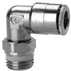
Swivel Male Elbow Sprint®