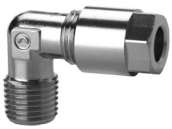
BSPT Fix Male Elbow